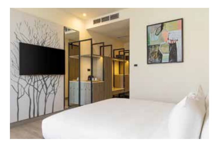
gardens, our Executive King Rooms offer spacious respite with