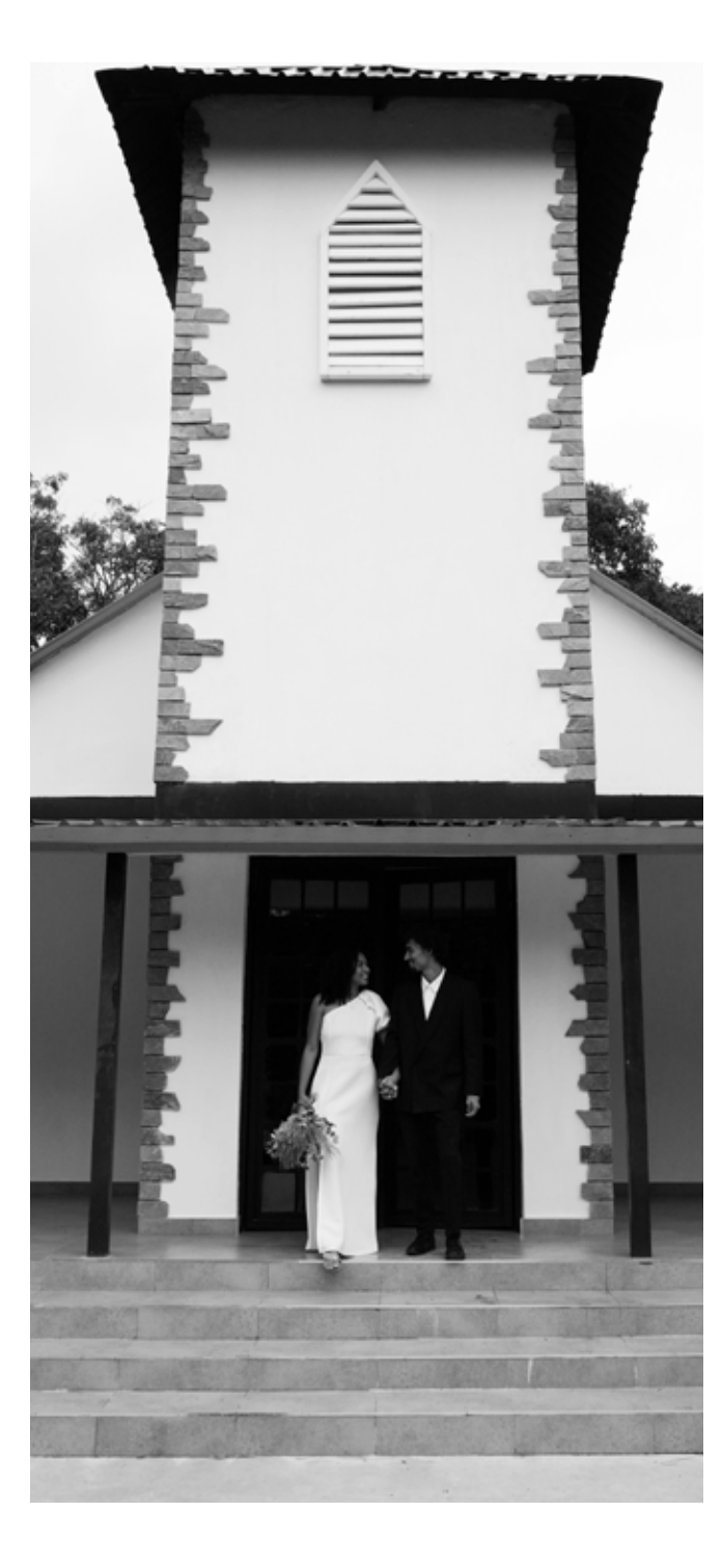
CHAPEL Seating for 120 guests 100 guests inside and an extra 10 on each wing